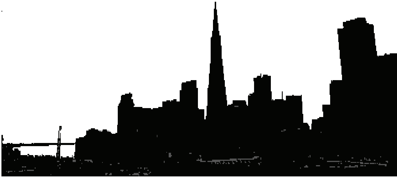
PAGE 6 | SFAGO NEWSLETTER | MARCH 2009