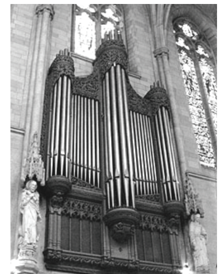
The Organ at Grace Cathedral, San Francisco

The SFAGO Newsletter is published monthly (except July) by the San Francisco Chapter, American Guild of Organists. Opinions stated herein are those of the individual contributors and do not necessarily reflect official policies of this Chapter. The deadline for receipt of all newsletter items is the 10th of the month preceding publication.